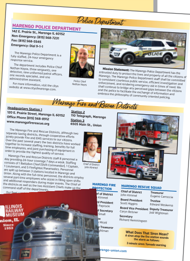
SAMPLE PG WITH FULL COLOR (SUBJECT TO CHANGE)

Chamber Membership Dues must be paid in full at the time of reservation to receive the member rate.